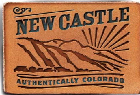
Town of New Castle