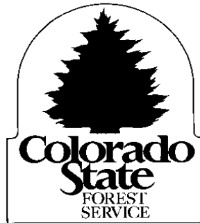
Colorado State Forest Service