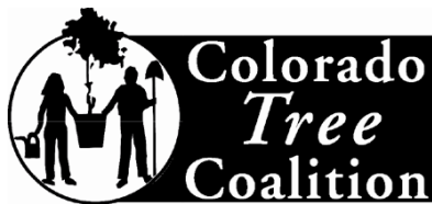
Colorado Tree Coalition